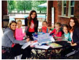
Craft time is always a hit!

KIDS' LOCK-IN July 30 - 31 Arrive at six