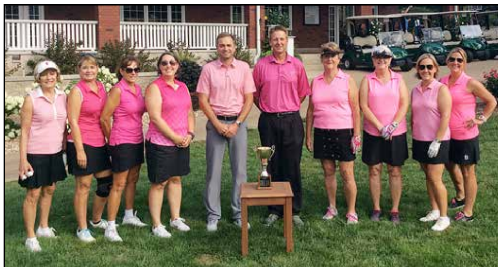
Challenge Cup Team